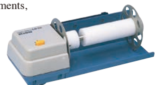
Chart winder LB-23

For long-term measurements, a chart winder with a matching design is available.