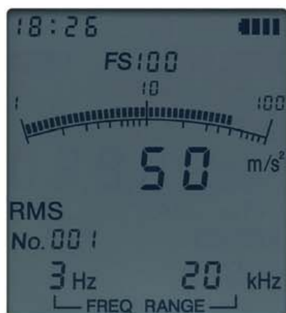
Measurement data display screen

The large LCD panel displays the bar graph meter and numeric reading at the same time, making it easy to visually evaluate any changes immediately. The display also shows the frequency range setting and other useful information. Backlighting can be turned on if required, allowing use of the unit also in dark locations. In case of overload, the indication "OVER" appears, and the entire display color changes to red.