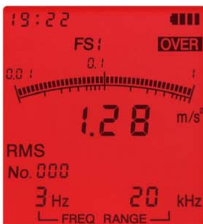
Overload indication screen