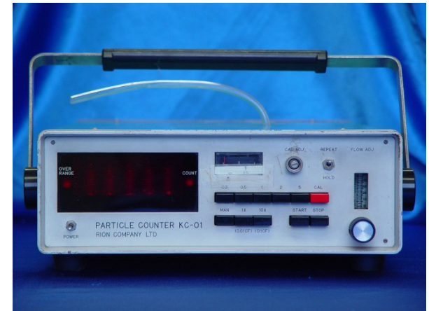
Particle Counter: 1977