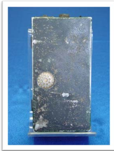
First Hearing Aid model Model H501, commercially introduced in 1948