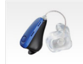
BTE (behind the ear) Hearing Instruments

Rionet Hearing Instruments and related products Medical equipment