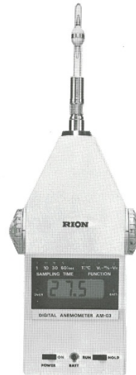
Transistorized Anemometer: 1981