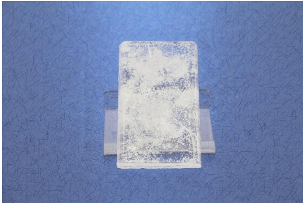
Rochelle Salt Crystal (Crystal Element)