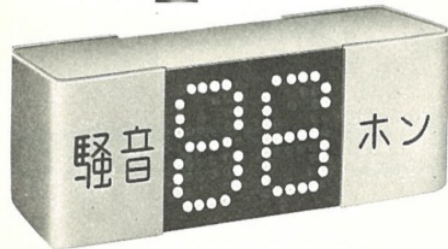
Sound Level Display Device (for roadside use): 1969