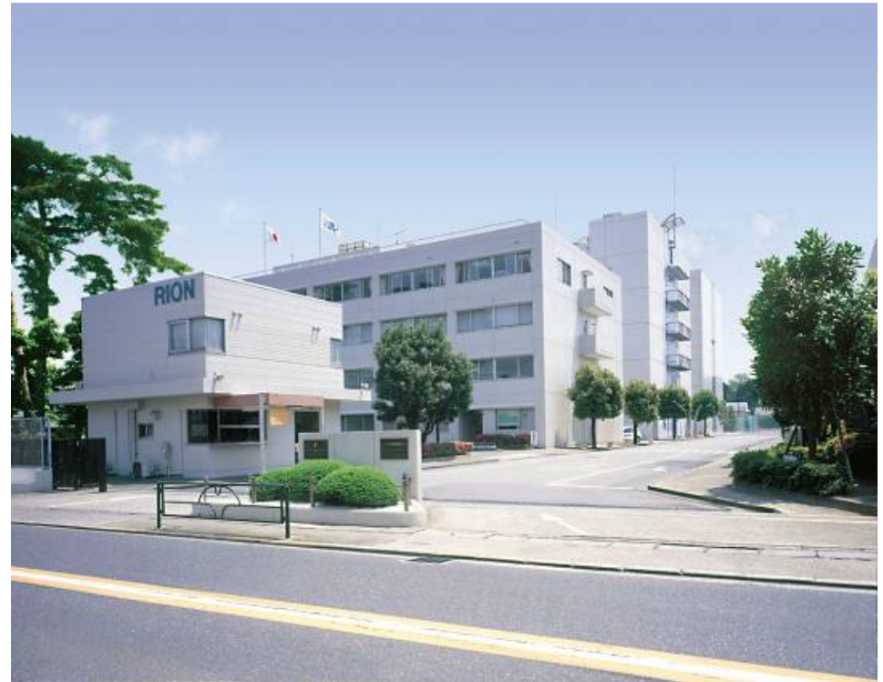
Head Office in Kokubunji, Tokyo

Employees 757 (consolidated; as of March 31, 2015)