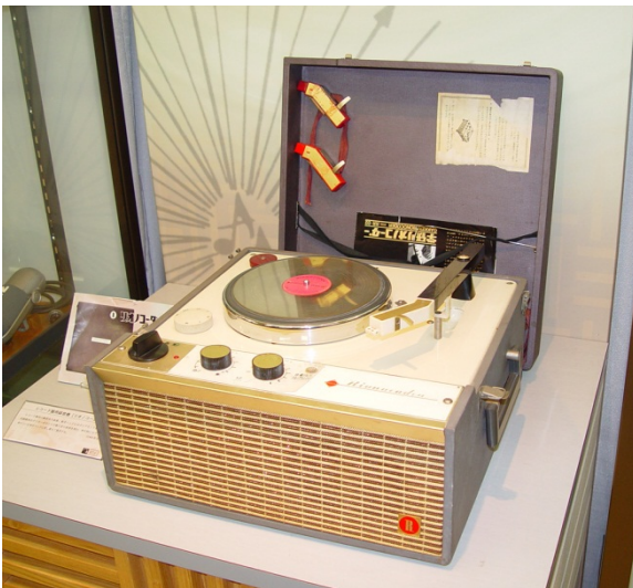
Rionocoder, Analog Disk Recorder and Player