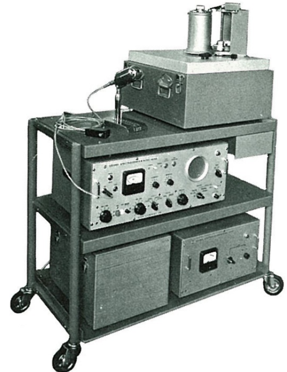
Voiceprint Analyzer (Sound Spectrograph): 1960