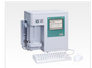
Liquid-borne Particle Counters