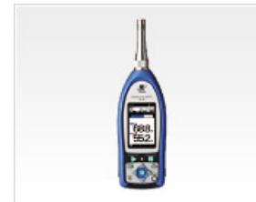
Sound Level Meters

Sound and vibration measuring instruments Particle counters