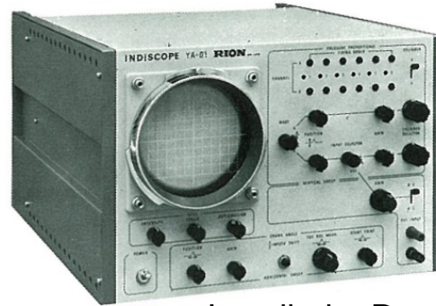
In-cylinder Pressure Measuring Device for engines (the Indiscope): 1973