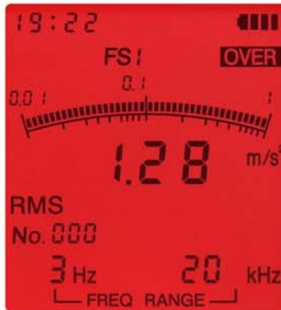
Overload indication screen