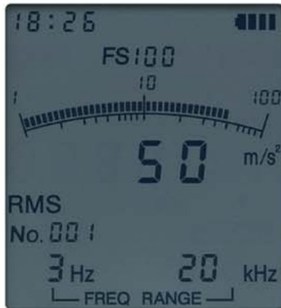
Measurement data display screen

The large LCD panel displays the bar graph meter and numeric reading at the same time, making it easy to visually evaluate any changes immediately. The display also shows the frequency range setting and other useful information. Backlighting can be turned on if required, allowing use of the unit also in dark locations. In case of overload, the indication "OVER" appears, and the entire display color changes to red.